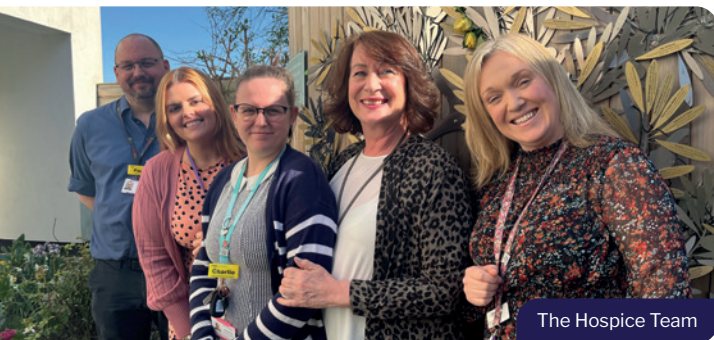
The Hospice Team

This September, 11 Hospice staff will be attempting to climb Mount Snowdon