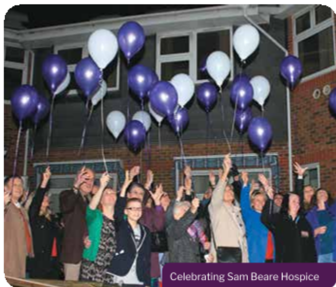
Celebrating Sam Beare Hospice

"We cannot thank the Sam Beare Committee enough for supporting the Hospice for all these years and for ensuring that it has had such a high profile locally in the Weybridge area. Their hard work undoubtedly has made a difference to local residents being able to access the Hospice's care and we hope that this will continue for many years to come."