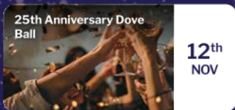
25th Anniversary Dove Ball

We have already filled our charity places but if you have secured your own place and would like to run for us see page 15 for more information.