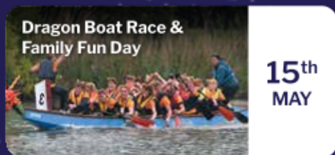
Dragon Boat Race & Family Fun Day