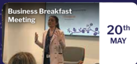
Business Breakfast Meeting

Join us at Goldsworth Park Lake for a fun packed day for everyone. A wonderful family event from 10am - 4pm. See page 14 for more information.