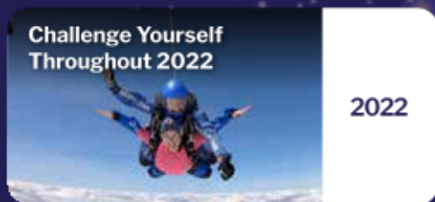
Challenge Yourself Throughout 2022

Our popular Dove Ball will return to help celebrate our 25th Anniversary at the Runnymede Hotel, Egham. See our website for more information: wsbhospices.co.uk/ball .