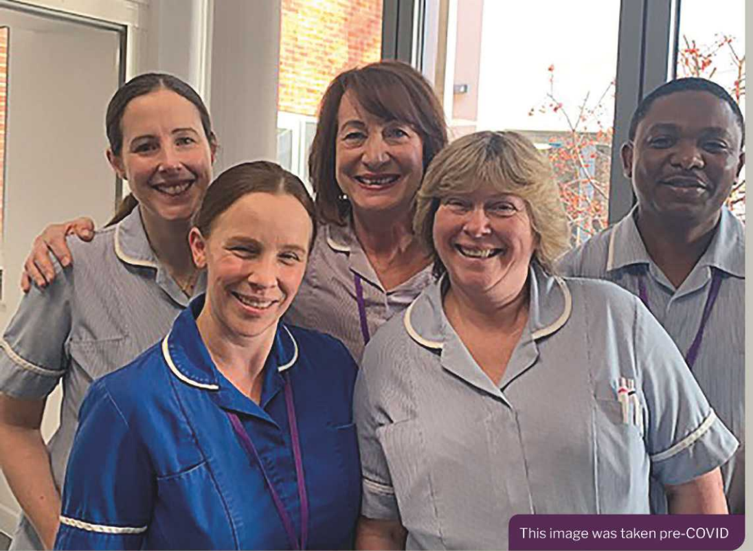
This image was taken pre-COVID